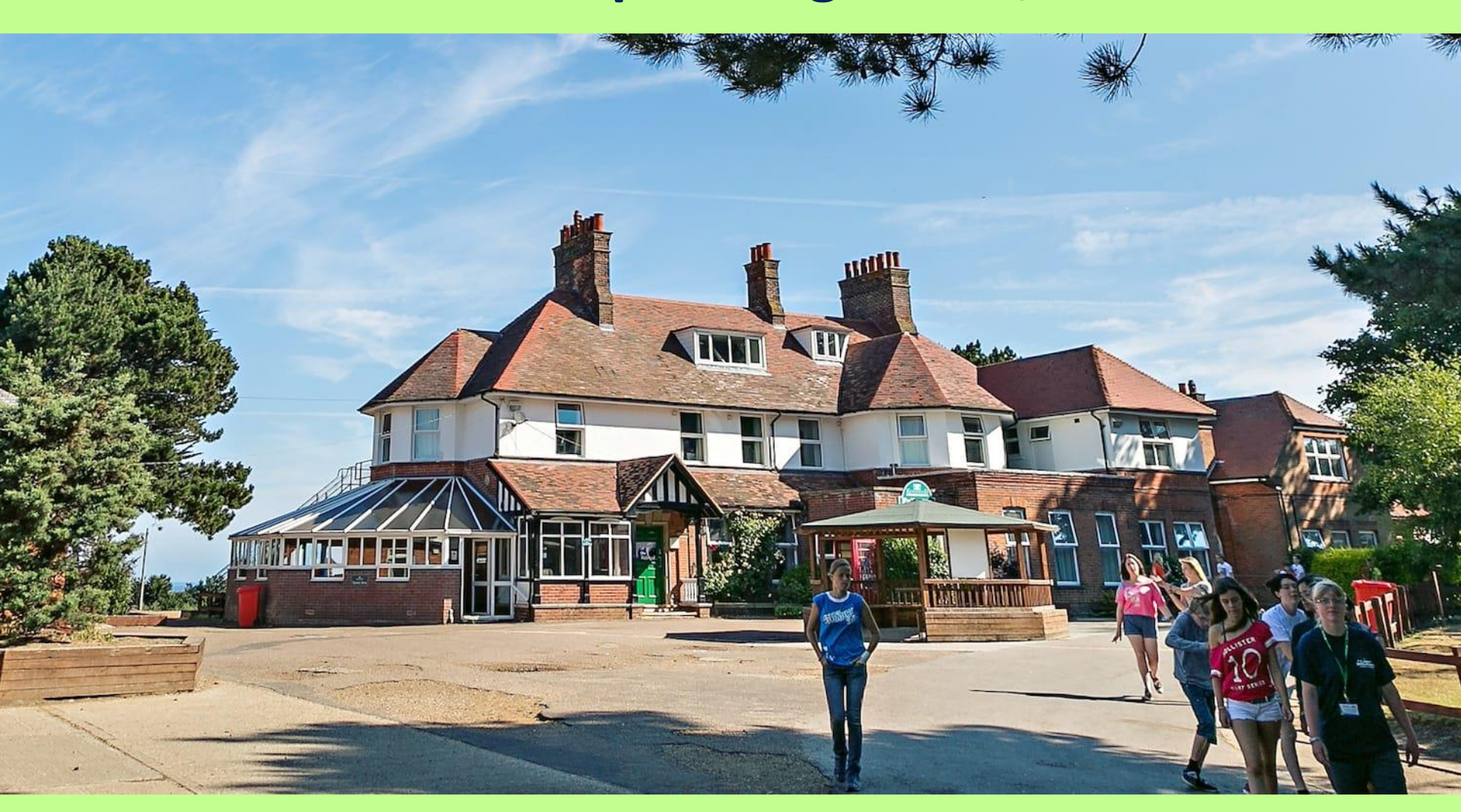
Mon 3<sup>rd</sup> – Friday 7<sup>th</sup> June 2024